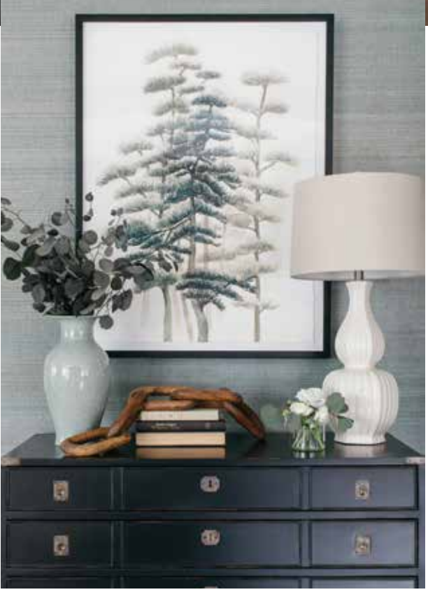
From top: Wallpaper from Relativity Textiles; in the family room, artwork from the clients' own collection hangs above a lamp from The Pep Line; a Pep Line Bree coffee table centers the room.