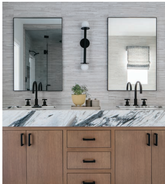
Clockwise from top left: The primary bath’s custom vanity by Eurocraft, Inc. is complemented by Visual Comfort’s Nades 2 sconce and a vanity wall in Grigio Muretto tile from Stone Source; the stunning navy blue floor-to-ceiling bookshelves by JJ Millwork Designs—inspired by the client’s first job as a bookseller at Barnes & Noble—are one of the project’s pièces de résistance; the dining room features RH’s Parsons dining table in reclaimed Russian Oak, Ferris dining chairs by Burke Decor and a Palecek Quinn chandelier from CAI Designs.

Sums up Bickley, “The clients are elated with the house’s evolution. It was very dark and tired before we started, with lots of odd choices and outdated designs. Upon finishing it, we had a light, bright, airy space full of color. The rooms felt like our clients and each of their personalities. They entertain more, cook more and overall spend time in all the rooms, because they feel inviting.” ■